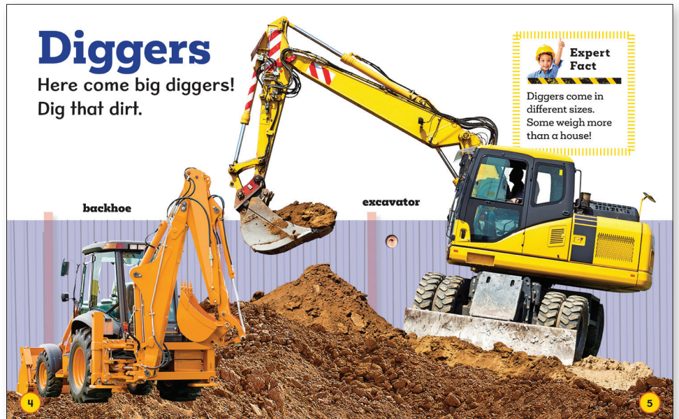
Sample spread from Construction Trucks